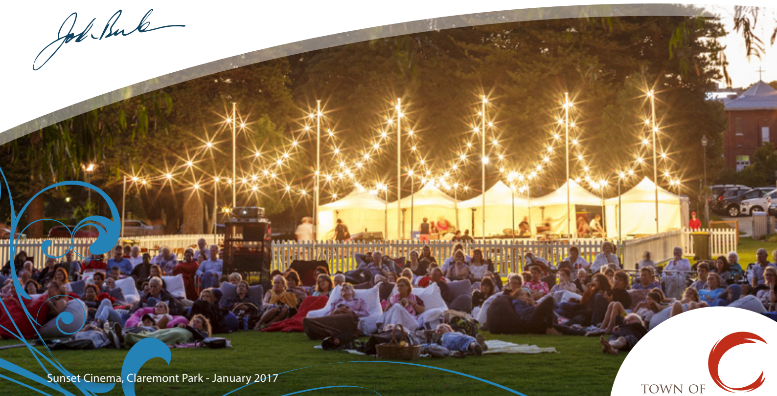
Sunset Cinema, Claremont Park - January 2017