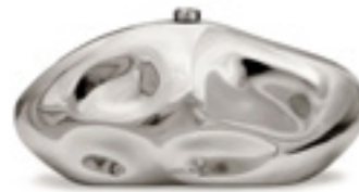
6. Cult Gaia Caldera Clutch in Silver $990 Cult Status