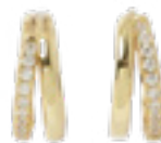
7. Winnie Gold Huggie Earrings $75 Arms of Eve