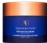
9. Augustinus Bader The Rich Eye Cream $327 Greenhaus Studio