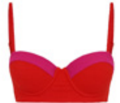
8. Blondie Bikini in Sol $179 Mister Zimi