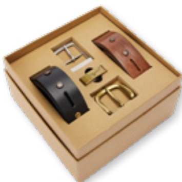
16. Belt Gift Set $269 RM Williams