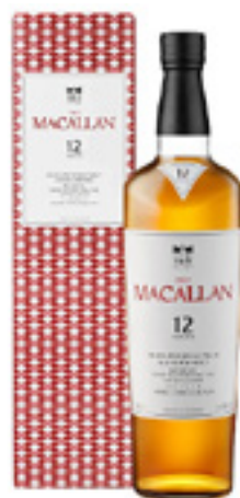
12. The Macallan Double Cask 12yr Scotch Whisky $142.99 Liberty Liquors