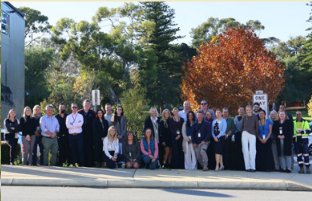
Town of Claremont staff adopted their own tree from fundraising efforts.