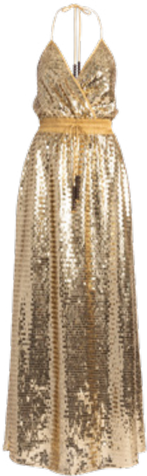
1. Marella Halter Neck Sequin Dress $665 Flannel