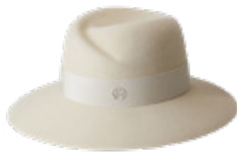
2. Maison Michel Virginie Hat in Seed Pearl $1,280 Adam Heath Boutique