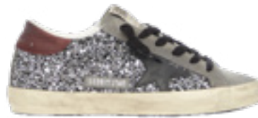
3. Golden Goose Glitter Suede Superstar Sneakers $732 Ricarda