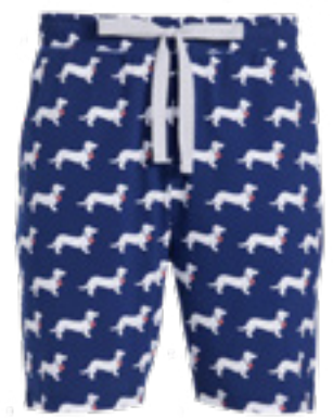
4. Navy Penny Logo Mid Short $79.95 Peter Alexander