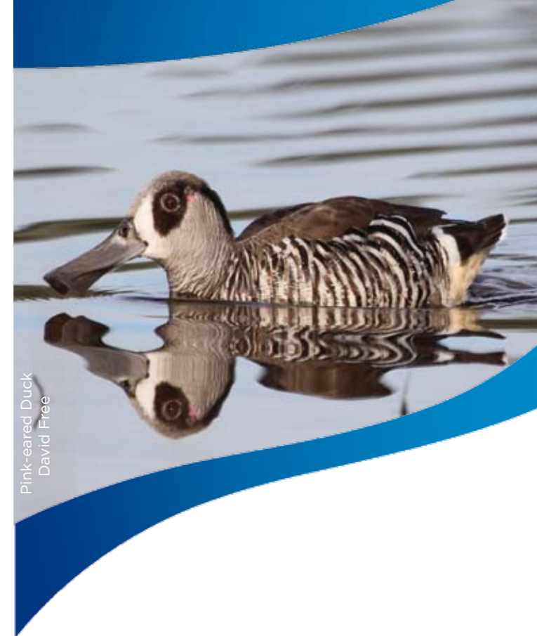
Pink-eared Duck