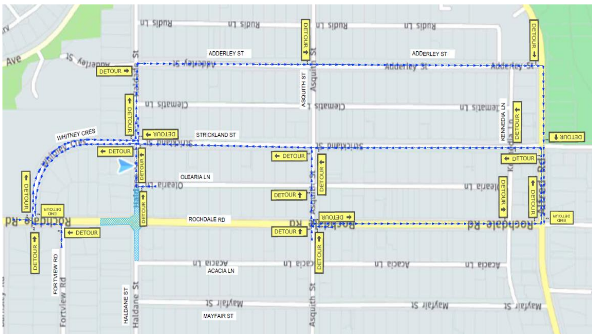
Detour 2 (Haldane St Roundabout Closure)